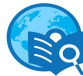
Mobile AP CTRN Online